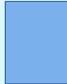
Vacancy – South West